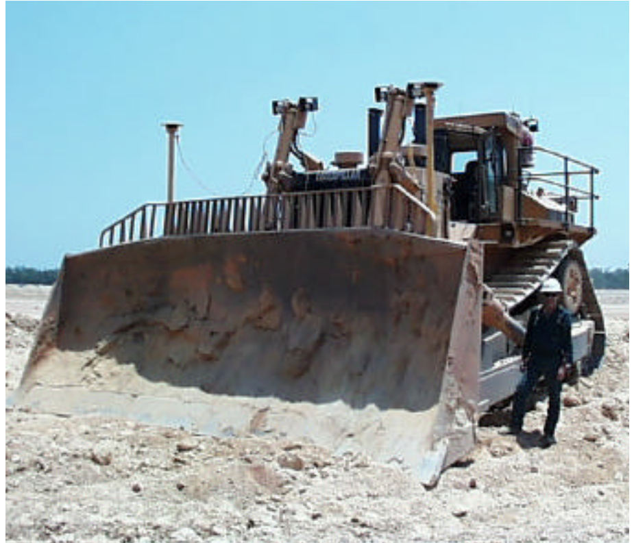
Allan Glinster (Heavy Equipment Operator) beside a D11 Bulldozer equipped with SiteVision.

In the bulldozer's cabin, a computer running SiteVision is used by the operators who adjust the blade height.